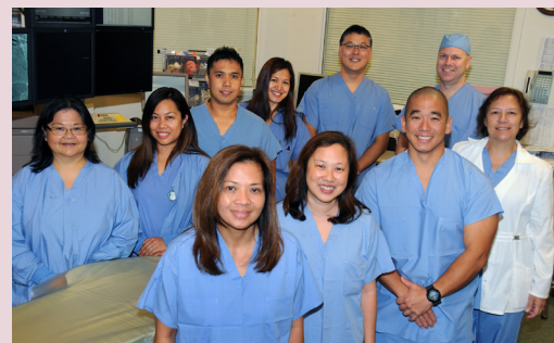
Cardiac Catheterization Laboratory Team

If you think you're having a heart attack, do not delay, call 911.